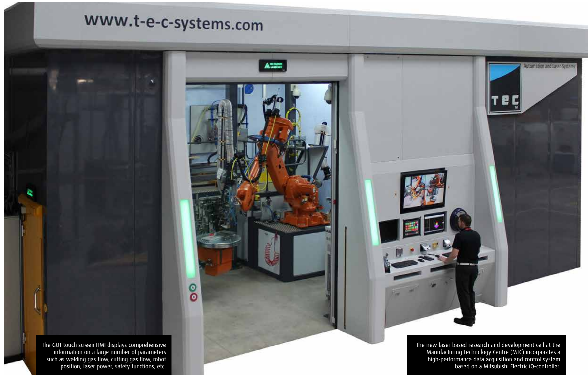
The GOT touch screen HMI displays comprehensive information on a large number of parameters such as welding gas flow, cutting gas flow, robot position, laser power, safety functions, etc.

Chris continues: "Just as important as collecting the data is interpreting it. To aid this at the MTC we have set up the HMI with clear, simple graphics; its large format makes for easy reading, while its touch screen operation ensures it is intuitive and easy to use."